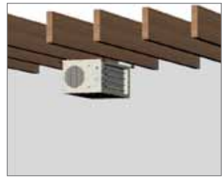
Horizontal air delivery; parallel to joists