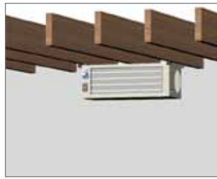
Horizontal air delivery; perpendicular to joists