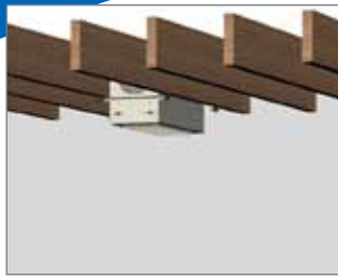
Vertical air delivery; recessed between joists